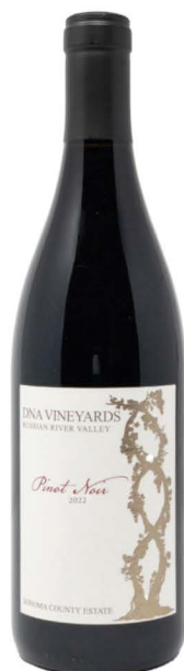
Consumers who will like these wines

*Based on Tastry's proprietary consumer sentiment analysis and US consumer palates database.